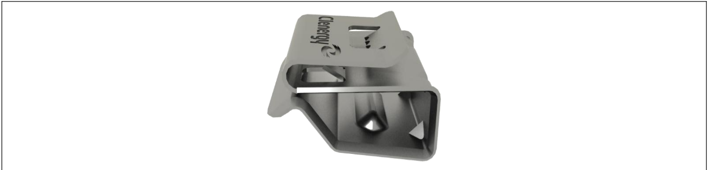
Cable Clip for PV Panels for Holding 2 Cables Part No.: EZ-CC-PV/2