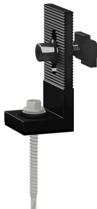
Black Tin Interface with C5 Rated Screw Part No.: ER-I-05/C5/BA (bar code: 10-001-00952)