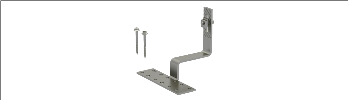
PV-ezRack SolarRoof, Tile Interface, Galvanized Steel, Buildex Wood Screw 6.3x65 Part No.: ER-I-01/CS (bar code: 11-003-00059)