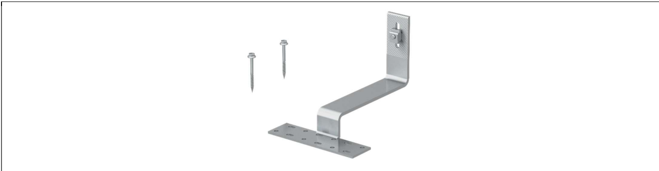
Tile Interface, 190 mm Horizontal Arm Part No.: ER-I-71 (barcode: 12-003-00111)