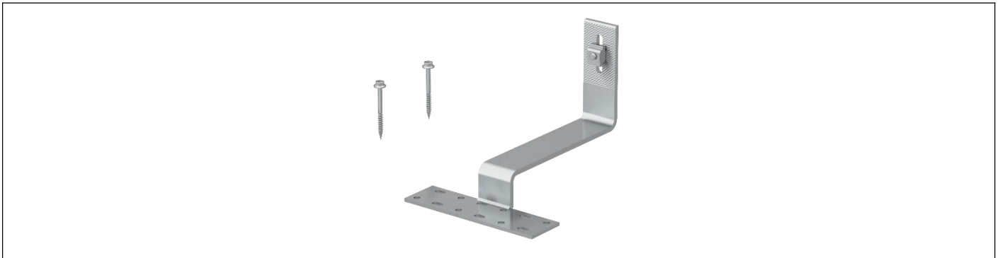
Tile Interface, 190 mm Horizontal Arm Part No.: ER-I-71 (barcode: 12-003-00111)