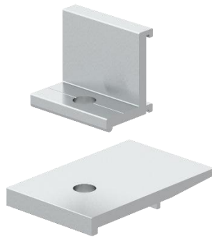
Cross Connector Clamp and Plate Kit Part No.: K-CRC/PT (bar code: 10-006-01577)