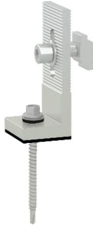
Tin Interface with Buildex Screw 6.3x70 Climaseal 5 Part No.: ER-I-05/C5 (bar code: 13-12015-154)