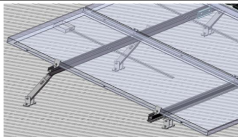
Install on tin roof directly